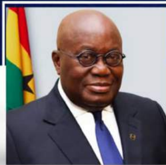
H.E. NANA ADDO DANKWA AKUFO-ADDO Keynote Speaker & Special Guest of Honour