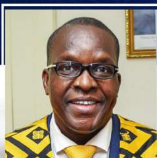
RT. HON. ALBAN S.K. BAGBIN Speaker & Guest of Honour (Day 2)